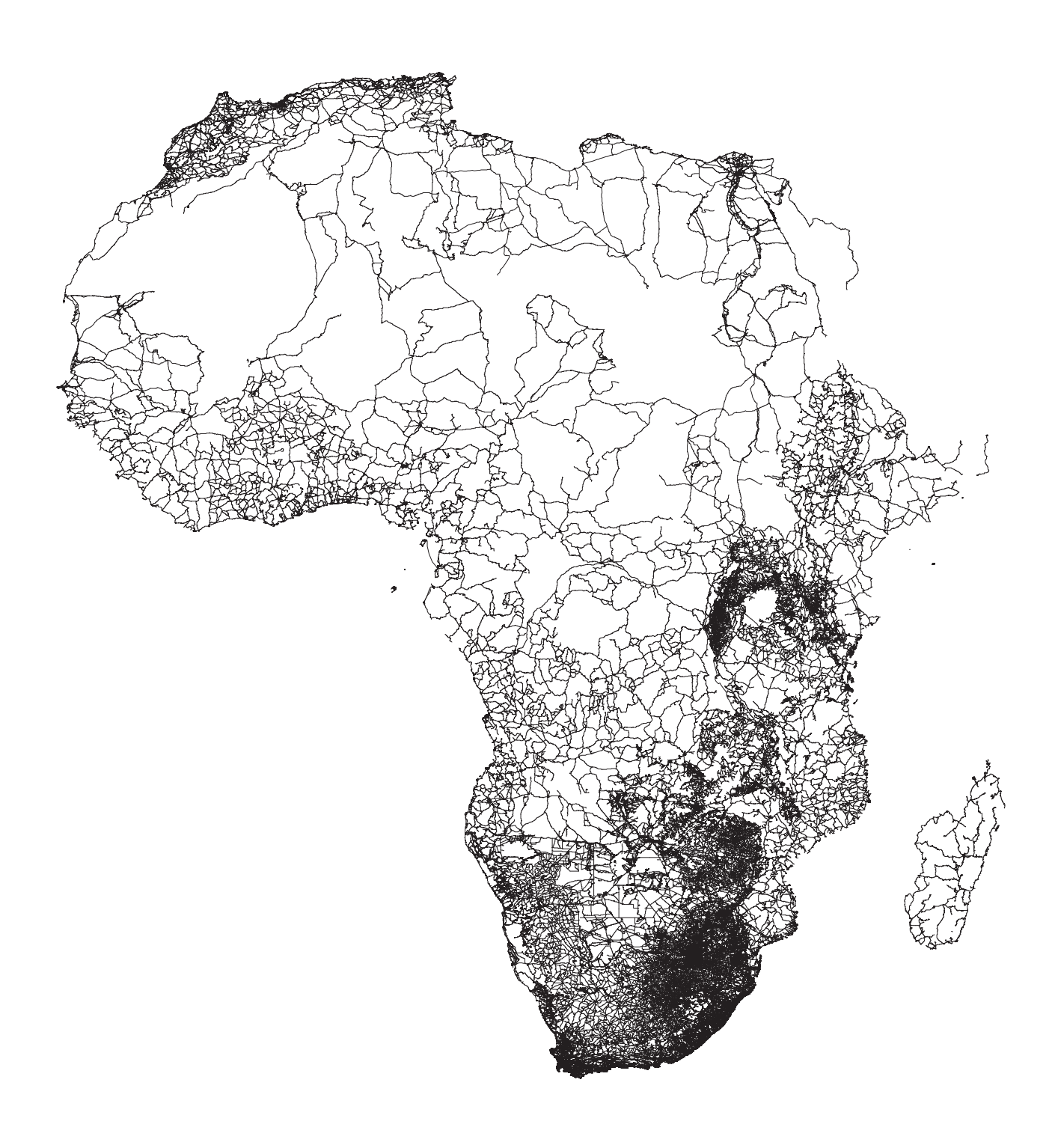
Figure 1 Tracks4Africa Road Coverage version 24.05