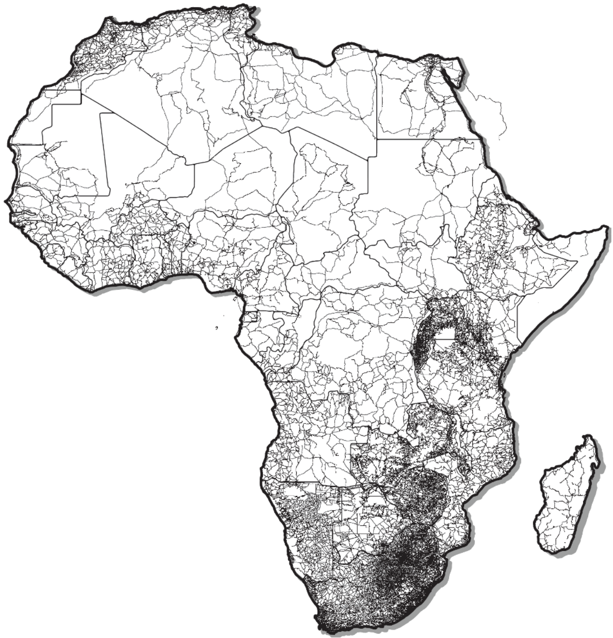
Figure 1 Tracks4Africa Road Coverage version 23.05