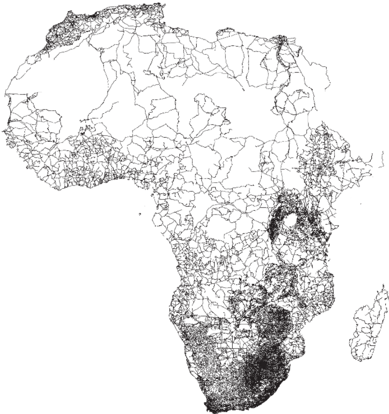
Figure 1 Tracks4Africa Road Coverage version 22.10